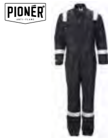
PIONÉR ARR215GCOV Nomex® Comfort Coverall 220gm 2 Sizes: XS - 5XL Fits: 31" and 33" inside leg lengths Colour: Navy