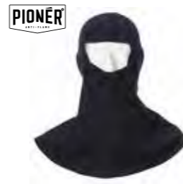
PIONÉR WMP09 Flame Retardant Balaclava 200gm 2 Size: One Size Colour: Navy