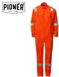
RIGGFRAS220 Lightweight Riggmaster Coverall 220gm 2 Sizes: 38"-60" Fits: 33" inside leg length Colours: Navy, Royal Blue, Orange and Red