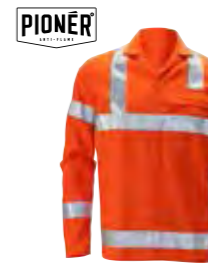
PIONÉR AT23A Flame Retardant Jacket 365gm 2 Sizes: 84cm - 140cm and Made to Measure Colour: Orange