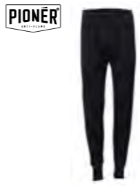
PIONÉR WMP08 Flame Retardant Male Long John 200gm 2 Sizes: XS - 6XL and Made to Measure Fits: Regular, Tall, Short, Extra Short and Extra Tall Colour: Navy