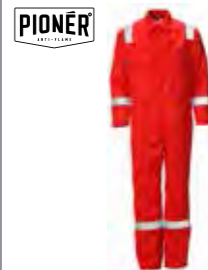
PIONÉR ARR255GCOV Nomex® Comfort Coverall 260gm 2 Sizes: XS - 5XL Fits: 33" inside leg length Colours: Royal Blue, Orange and Red