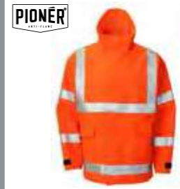
PIONÉR HV134 Multi-Norm Waterproof Jacket 465gm 2 Sizes: S - 5XL and Made to Measure Colour: Hi Vis Orange