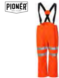
PIONÉR HV135 Multi-Norm Waterproof Trousers 465gm 2 Sizes: S - 5XL and Made to Measure Fits: Regular, Short, Tall and Extra Tall Colour: Hi Vis Orange