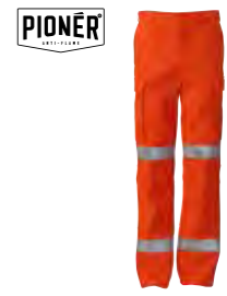
PIONÉR AT22A Flame Retardant Trousers 365gm 2 Sizes: 72cm - 140cm and Made to Measure Fits: Regular and Tall Colour: Orange