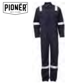
FRASCOV Riggmaster Anti-Static Coverall 350gm 2 Sizes: 38"-60" Fits: 31" and 33" inside leg lengths Colours: Navy, Royal Blue, Orange and Red