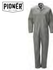
PIONÉR BS1FK Arc Protection Coverall 365gm 2 Sizes: 84cm - 140cm and Made to Measure Fits: Regular and Tall (Black Only) Colours: Graphite, Royal Deep Blue and Black