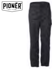
PIONÉR ARR215GCAR Nomex® Comfort Cargo Trousers 220gm 2 Sizes: 28" - 48" Fits: 31" and 33" inside leg lengths Colour: Navy