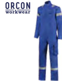
ORCON workwear 18008/480 Protective Multi Protect Reflex Coverall Logan 350gm 2 Sizes: 90cm - 128cm Fits: 83cm inside leg length Colours: Black, Navy, Royal Blue, Orange and Red