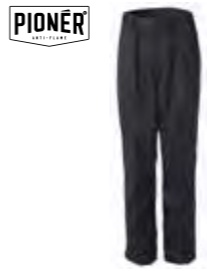
PIONÉR ARR215GTRS Nomex® Comfort Trousers 220gm 2 Sizes: 28" - 48" Fits: 31" and 33" inside leg lengths Colour: Navy