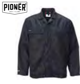
PIONÉR ARR215GJKT Nomex® Comfort Jacket 220gm 2 Sizes: XS - 5XL Colour: Navy