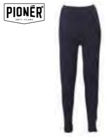
PIONÉR WMP08F Flame Retardant Female Long John 200gm 2 Sizes: 8 - 26 and Made to Measure Fits: Regular, Tall, Short, Extra Short and Extra Tall Colour: Navy