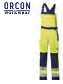
ORCON workwear 68012/483 Protective Multi Protect Salopette Philip 300gm 2 Sizes: 90cm - 128cm Fits: 83cm inside leg length Colour: Hi Vis Yellow and Navy