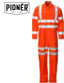
PIONÉR AT21A Flame Retardant Coverall 365gm 2 Sizes: 84cm - 140cm and Made to Measure Fits: Regular, Short and Tall Colour: Orange