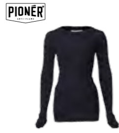
PIONÉR WMP07F Flame Retardant Female Top 200gm 2 Sizes: 8 - 26 and Made to Measure Fits: Regular, Tall, Short, Extra Short and Extra Tall Colour: Navy