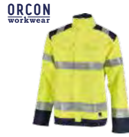
ORCON workwear 48012/483 Protective Multi Protect Jacket James 300gm 2 Sizes: S - 3XL Colour: Hi Vis Yellow and Navy