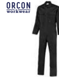
ORCON workwear 13801/488 Protective Multi Protect Classic Coverall Ulm 450gm 2 Sizes: 90cm - 128cm Fits: Dependant on chest size Colour: Black