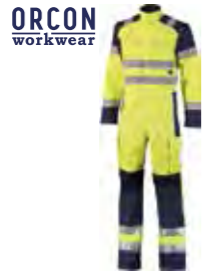
ORCON workwear 18012/483 Protective Multi Protect Coverall Matthew 300gm 2 Sizes: 90cm - 128cm Fits: 83cm inside leg length Colour: Hi Vis Yellow and Navy