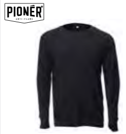
PIONÉR WMP07 Flame Retardant Male Top 200gm 2 Sizes: XS - 6XL and Made to Measure Fits: Regular, Tall, Short, Extra Short and Extra Tall Colour: Navy