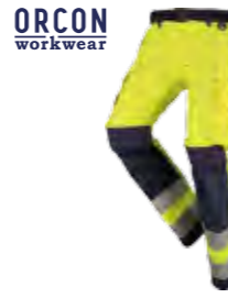
ORCON workwear 58012/483 Protective Multi Protect Cargo Trousers Florian 300gm 2 Sizes: 75cm - 128cm Fits: 83cm inside leg length Colour: Hi Vis Yellow and Navy