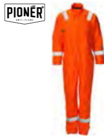
FRASARCCOV Anti-Static Arc Protection Coverall 350gm 2 Sizes: 38"-60" Fits: 33" inside leg length Colours: Navy, Royal Blue, Orange and Red