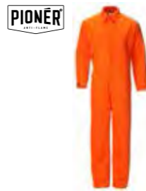
WLDMASTERAS Weldmaster Coverall 350gm 2 Sizes: 38"-60" Fits: 33" inside leg length Colours: Navy and Orange