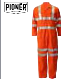
PIONÉR HV82 Flame Retardant Coverall 365gm 2 Sizes: 84cm - 140cm and Made to Measure Fits: Regular and Tall Colour: Orange