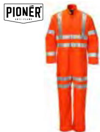
ORCON workwear HV210 Multi-Norm Coverall 270gm 2 Sizes: XS - 5XL and Made to Measure Fits: Short, Regular, Tall and Extra Tall Colour: Hi Vis Orange