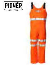
PIONÉR HV196 Multi-Norm Waterproof Salopette 465gm 2 Sizes: S - 5XL and Made to Measure Fits: Regular, Short, Tall and Extra Tall Colour: Hi Vis Orange